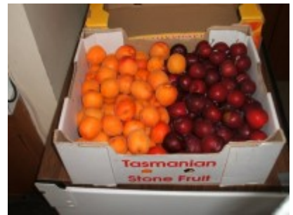
Yummy apricots and blood plums