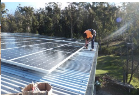
80 solar panels -a 2013 project