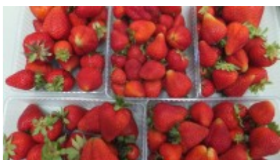
Another delicious season