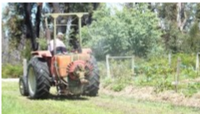
The turbo miser spray unit saves lots of hours