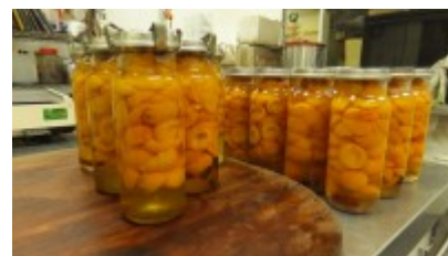
beautiful fruit leads to beautiful preserves which we will enjoy in the winter mnths