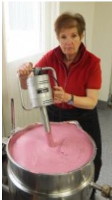
rich berry ice-cream- everyone's favourite