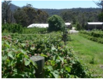
Looking down the hill to our farm buildings

Bulk packs now available for restaurants