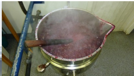
black currant jam- a great flavour