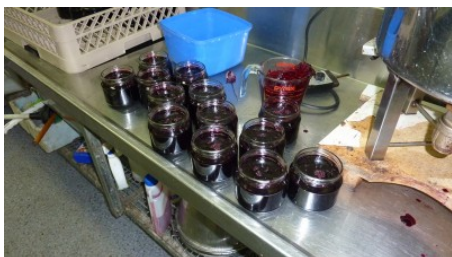
and now the bottling