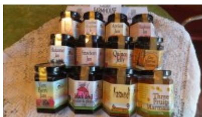
we now have a large range of great products