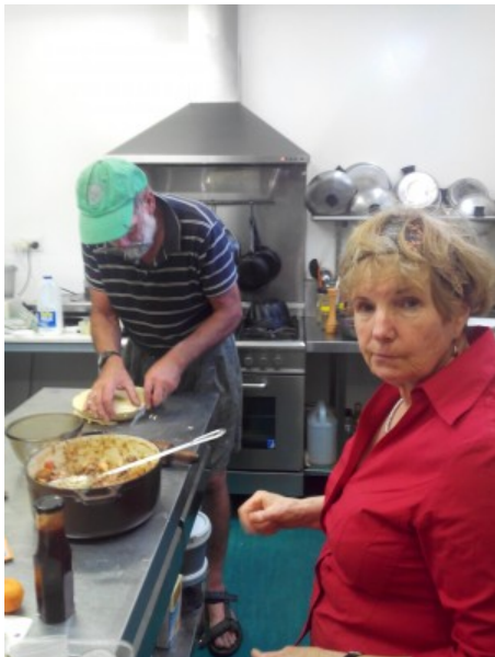
empanadas is all the go