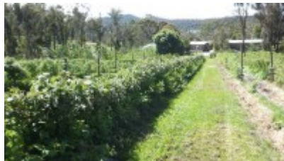
Trellising blackberries is one of the jobs we loathe- but the result is rewarding