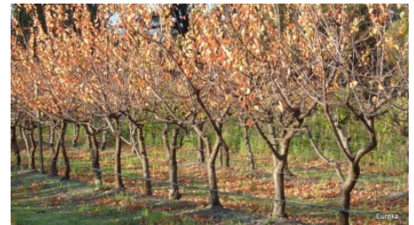
Leaves on the apricots are starting to drop now.